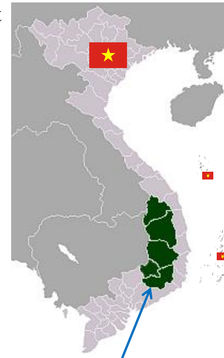
Central Highlands of Vietnam

3 But mostly Vietnam has to import quality product 100% from Germany, India, USA ... Farmers face the problem of products they make will be redundant, unmarketable... leading to bankruptcy.